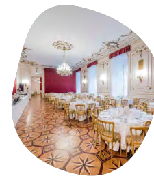
The Wintergarten features an extraordinarily view of the opulent buildings along the Wiener Ringstrasse. (Networking & Breaks)